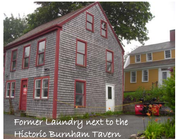
Former Laundry next to the Historic Burnham Tavern

Please visit our Brownfields Website at www.WCCOGBrownfields.com